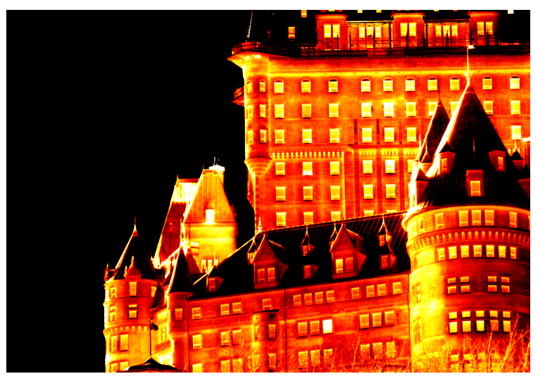
Quebec City's Château Frontenac in infrared

Since its beginning in 2000, Telops has distinguished itself with the quality of its technical personnel and its innovative approach to many technological challenges in the optics field. Today, the expertise of its scientists and the performances of its infrared cameras and hyperspectral imagers are internationally recognized.